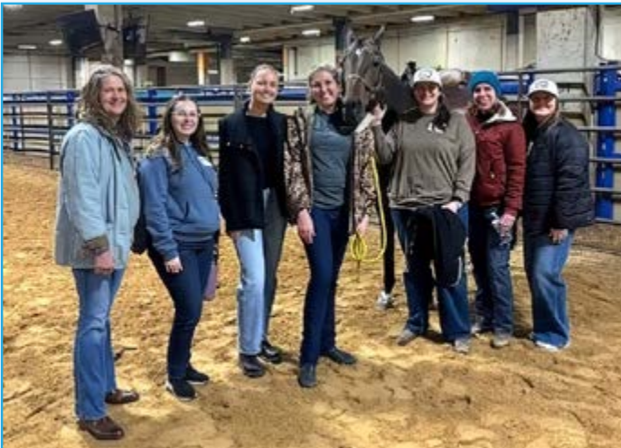
Home and Community Chisolm Challenge