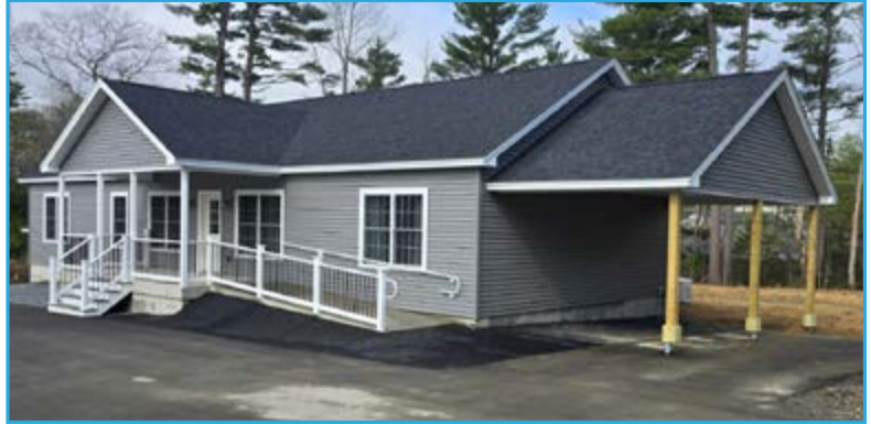
New Residential Home