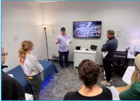
Home and Community NEW Assistive Technology Room