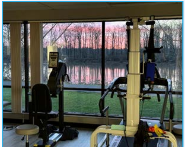
New Home & Community and Day Neuro Center of Excellence Center